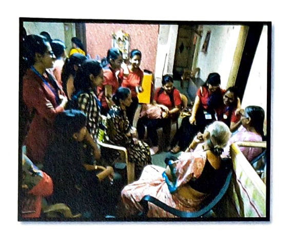
12<sup>th</sup> Jan 2019